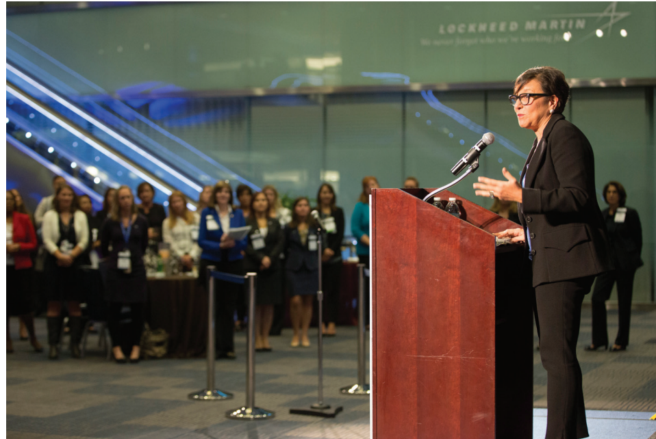
U.S. Secretary of Commerce Penny Pritzker Delivers Keynote Address at 13th Annual Lockheed Martin Women's Impact Network Leadership Forum

In today's era of big data, tools are available to measure, examine, and address issues of in-